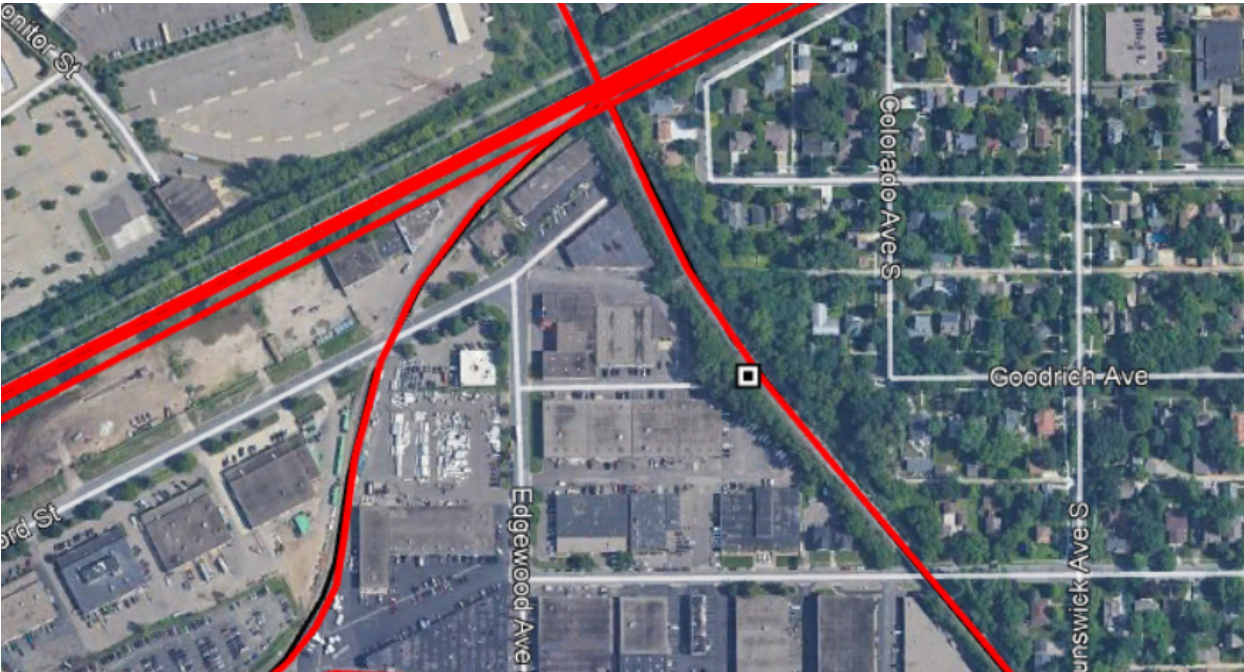
EXHIBIT B Minimum Safety Rules for Work on Railroad Property

An Example for your reference Cut and Paste a Copy and ADD a map of the location of the project